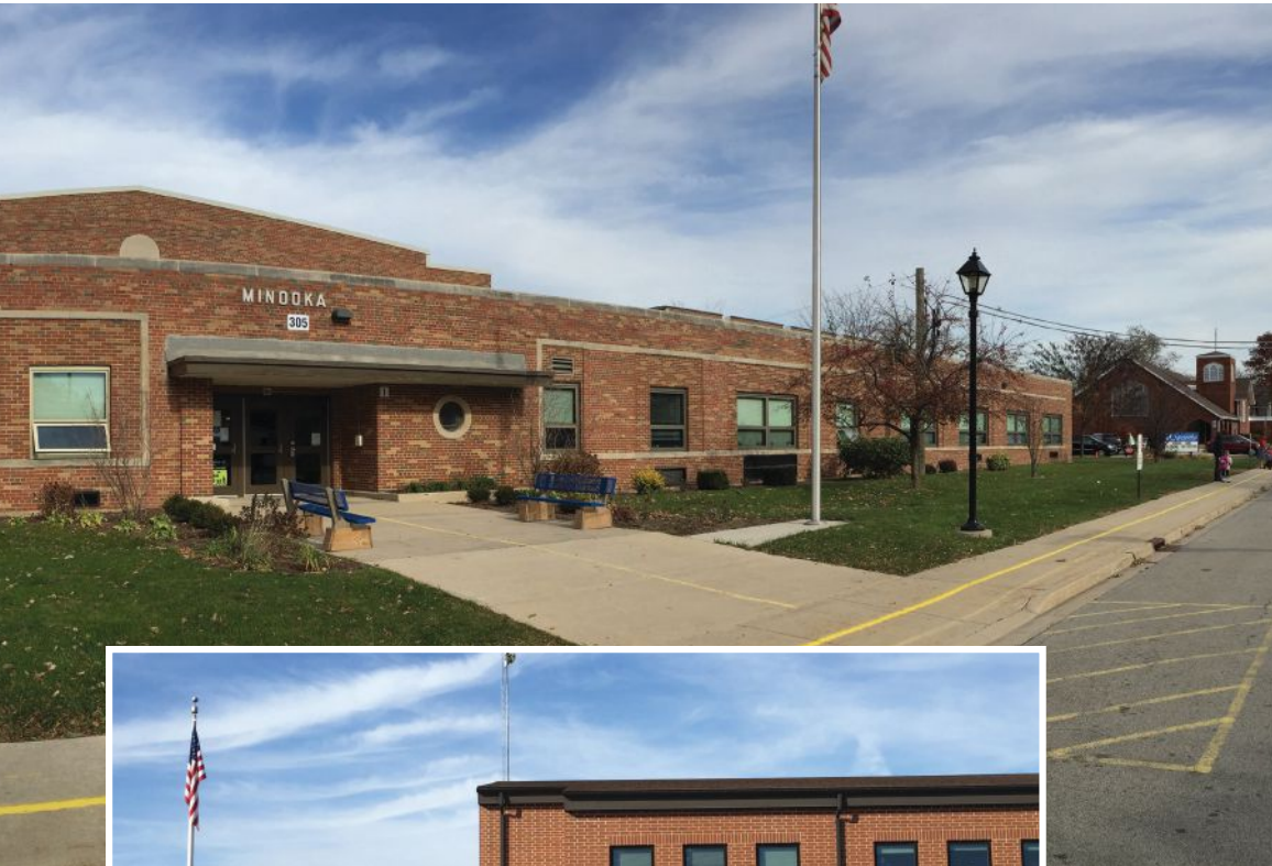
Minooka school, pictured here, is just one of several K-12 campuses in Illinois that have installed window safety and security film.