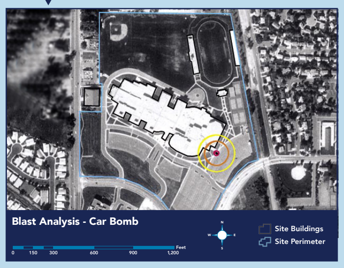
Picture 1: Blast analysis of a high school for a typical car bomb detonated in the school's parking lot.

The red ring indicates the area in which structural damage is predicted. The orange and yellow rings indicate predictions for lethal injuries and severe injuries from glass, respectively.