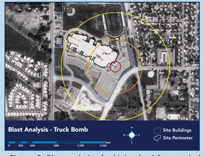
Picture 2: Blast analysis of a high school for a typical large truck bomb detonated in the school's parking lot.